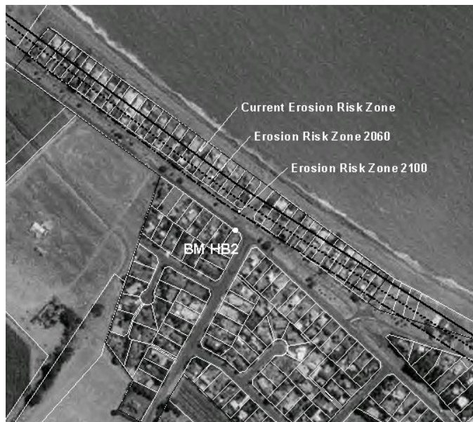
Figure 3: Predicted coastal hazard erosion zones along Hawke Bay shoreline (Tonkin & Taylor 2003)

While various different approaches currently exist, the results are the development of coastal hazard areas or zones in recognition of the local processes and hazards that exist (Figure 3). The development of these hazard areas enables a focus on appropriate development and use of that land.