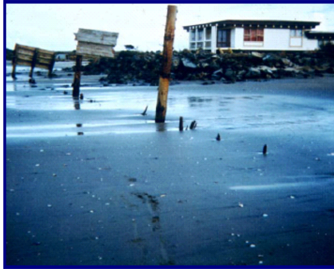
Figure 1: Erosion at Omaha North

Unfortunately, Omaha is not the only example of development set-up too close to the coast. There are many coastal communities developed close to the coastal margin that experience significant erosion resulting in a wide range of protection works.