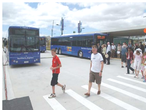
Albany Park and Ride Station