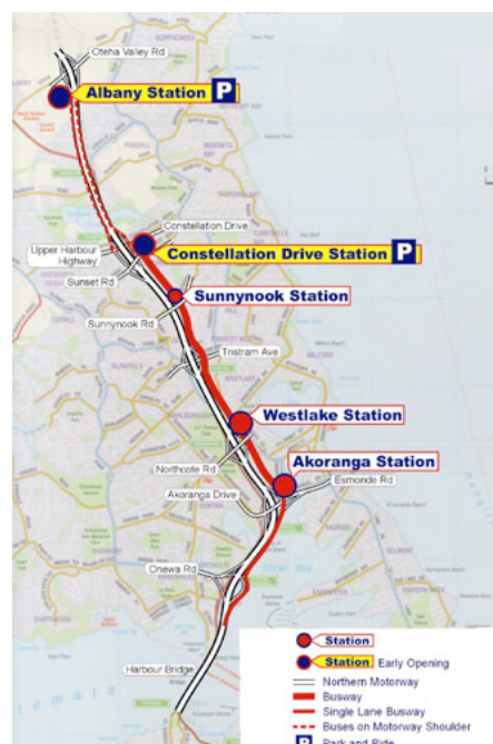
Busway route map

Stations will be the exit and entry point for buses and HOVs, and will cater for passengers arriving by foot, bike, car and bus. Albany and Constellation stations will have park and ride facilities. Passengers will also be able to transfer between bus routes at the stations.