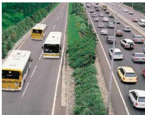
Example of the Brisbane busway

The busway infrastructure of bus lanes and busway stations will provide good integration and connection between a local and regional bus network, which are key elements of good urban design. This will provide an improved passenger transport service both within North Shore City and over the Harbour Bridge to central Auckland via Fanshawe Street. In peak times, buses are expected to run every five minutes along the busway itself and every 15 minutes from most residential areas along main suburban routes.