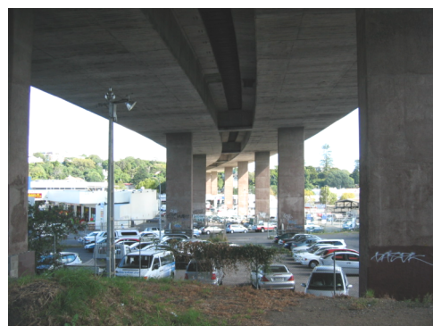
Existing landuse under Viaduct

Transit proposes to address the landuses beneath the Viaduct as part of the project in order to allow and encourage greater community connectivity and flow between north and south Newmarket.